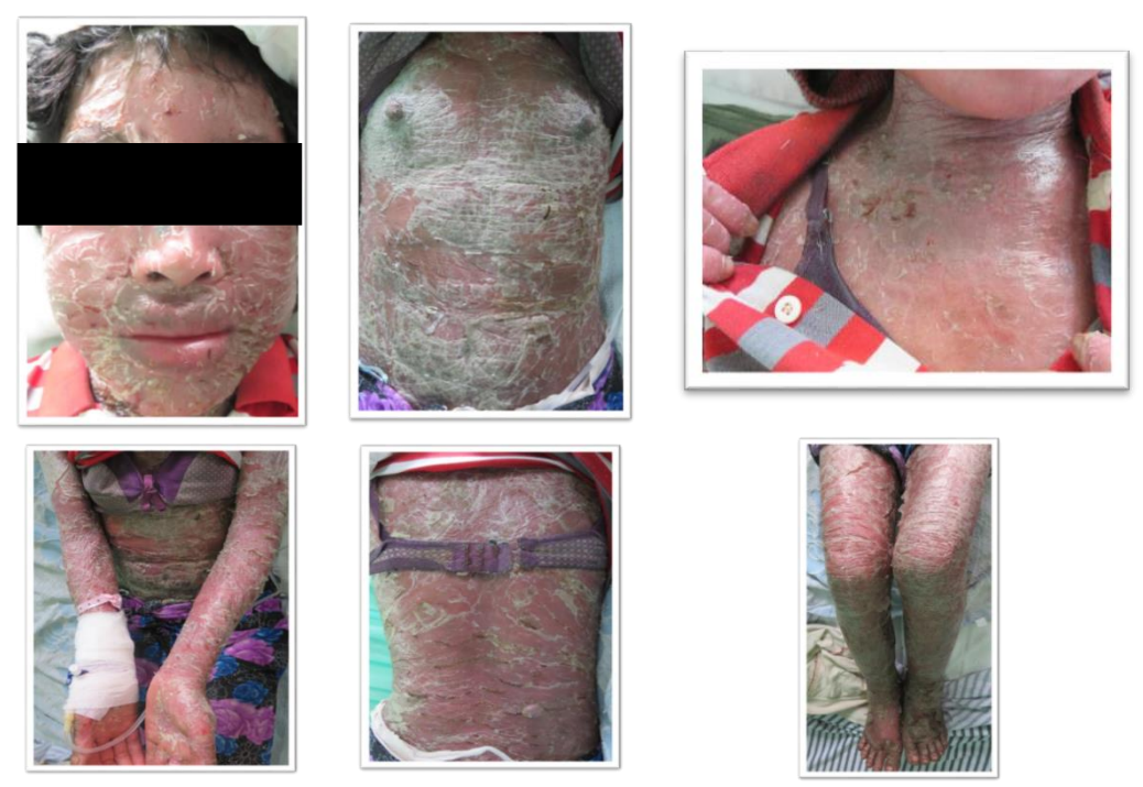
Figure 1 . Physical examination on the patient showed diffuse erythematous macules covered with thick white scales, some erosions can also be seen.

Dermatology status on his face, chest, both arms and legs showed diffuse erythematous macules covered with thick white scales, multiple well-circumscribed linear erosions were also seen with various sizes from 1 \times 0.5 - 1 \times 0.8 cm (Figure 1). Diascopy examination revealed pale areas.